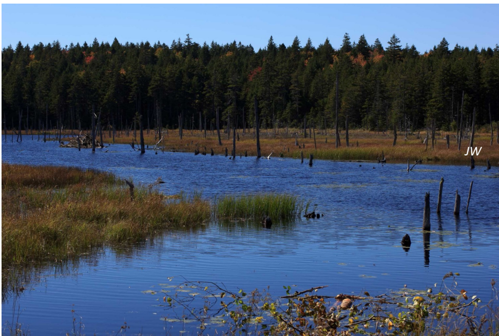
Take a Hike in Fundy National Park and find spots like this on Caribou Plains Trail.