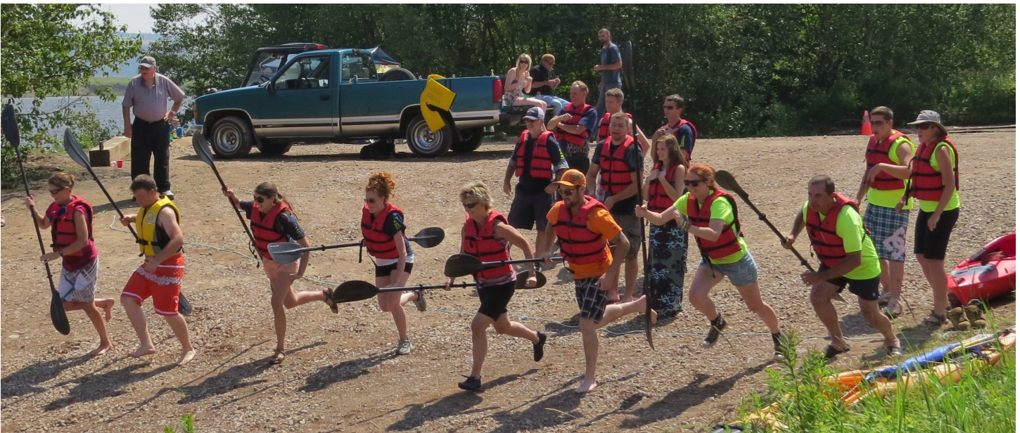
The kayak races have begun! Teams race to Shepody River in past Shepody Days.

Cruise In. 1-4pm. Kiwanis Centre, Hillsborough. "Come out and join some of the coolest Classics Cars, Street Rods, and Muscle Cars in Atlantic Canada set against the beautiful backdrop of the Petitcodiac River. Live music & BBQ. Proceeds from BBQ to local charities. Free to attend, just bring your classic car, lawn chairs, a friend, and be prepared to enjoy a fantastic afternoon!"