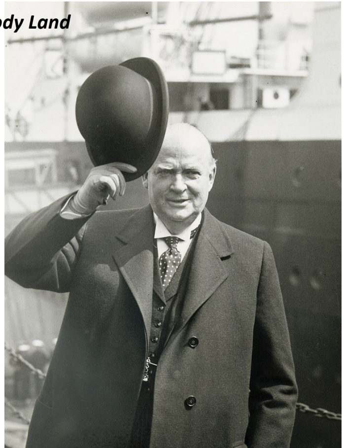
R B Bennett

The biggest deal of all is that he made it happen during one of the most difficult times in our country's economic history – the Great Depression. He