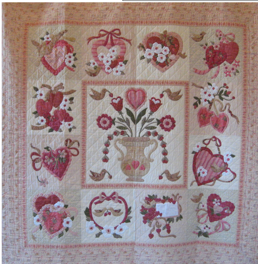
July 11-15: Fibre Arts & Quilt Fair.