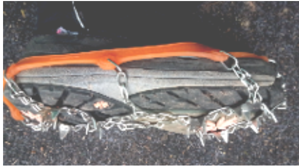
Cleats similar to the ones above are available at the Albert County Pharmacy in Riverside-Albert and Jean Coutu in Riverview.

We welcome women of Southeastern NB who love to hike, camp, and spend time in nature. Look up Women of the Wilderness (WOW) on Facebook, answer a few questions, and we hope to see you soon.