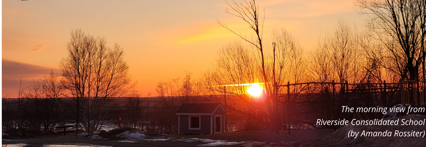
The morning view from Riverside Consolidated School