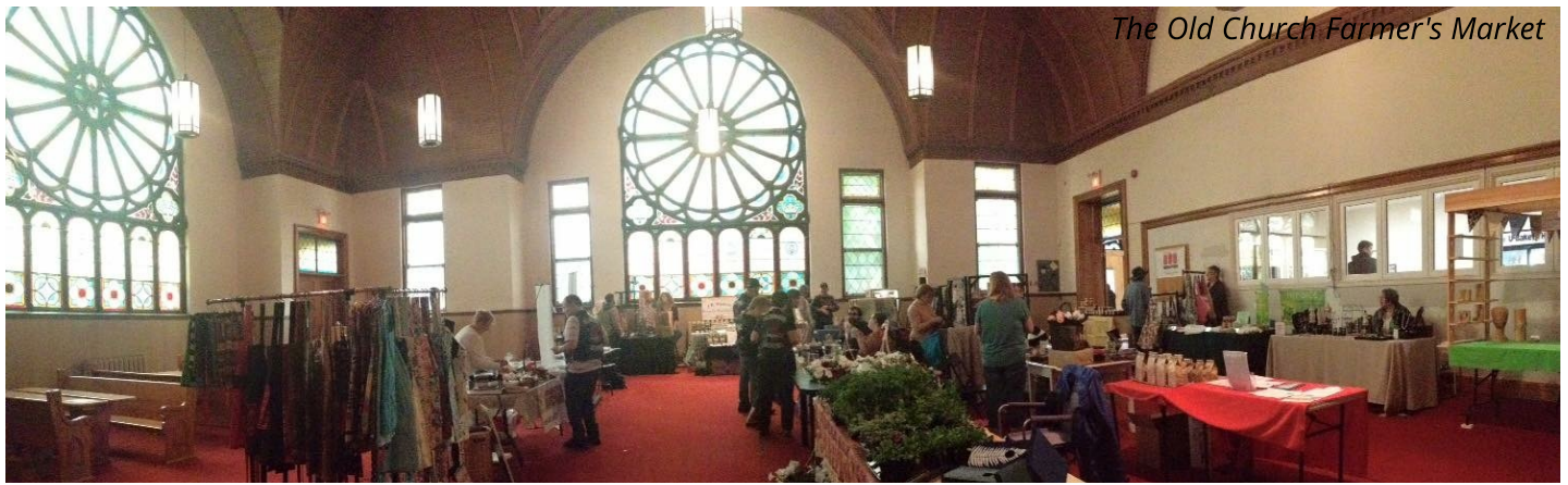
The Old Church Farmers Market