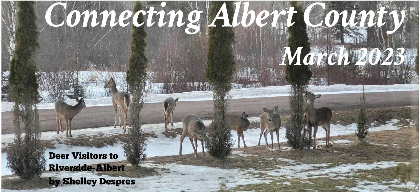
Deer Visitors to Riverside-Albert