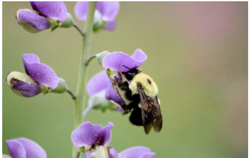
Two-spotted bumblebee feeding on lupins.

Stop by the pollinator garden in Fundy National Park or your local community garden and view the educational panels about the iconic monarch butterfly, yellow-banded bumblebees and other native pollinating species. Fundy Park Interpreters will be offering programs about pollinators throughout the summer, and Park Biologists will be using iNaturalist observations from the public in their species population and distribution data.