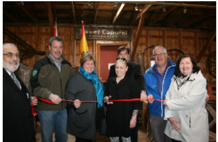
Dignitaries and invited guests at the ribbon cutting to officially open the "Acadians in Albert County" exhibit.

Information about the Albert County Museum's Acadian exhibit will be provided by the Chipoudy Monument Committee to the many Acadian visitors and the bus tours. The Acadian exhibit will become a permanent part of the Albert County Museum's collection. This project is supported by Tourism, Heritage and Culture New Brunswick.