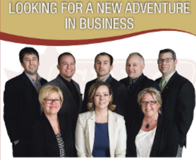
Come & meet our team to discuss our programs

Loan Programs: - CBDC Youth Loan CBDC First-Time Entrepreneur Loan - CBDC General Business Loan - CBDC Innovation Loan - CBDC Social Entreprise Loan