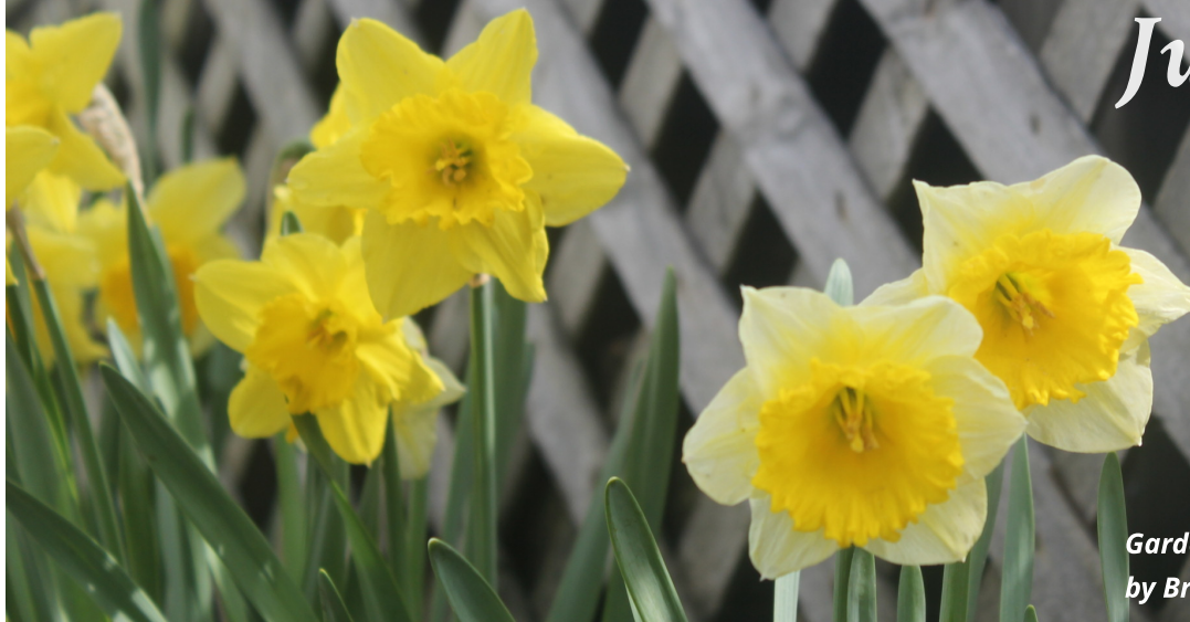
Garden Daffodils by Brooklyn Rossiter