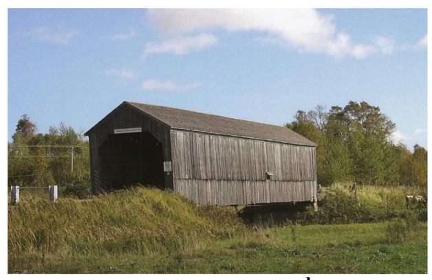
Celebrate the 3<sup>rd</sup>

Seniors Day in Fundy Albert. 11am-1pm. The Harvey Hall, 29 Mary's Point Rd., Harvey. Connect with friends, play amusing games of knowledge, enjoy snacks. Seniors 60 and older are invited.