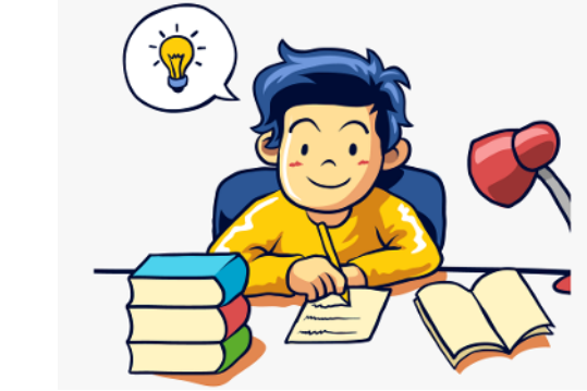
www.ConnectingAlbertCounty.org ~ 2

Do you have an idea, article or a piece of writing, or photograph that you would like to share in our newsletter? If so please submit it to the editor by email to info@connectingalbertcounty.org or mail it to Connecting Albert County, 8 Forestdale Rd., Riverside-Albert, NB, E4H 3Y7.